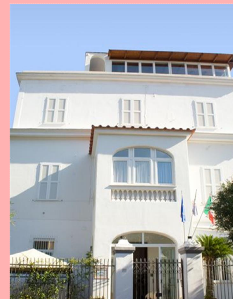
OUR RESIDENCE IN CORSO LUIGI MANZI 12 (80074 CASAMICCIOLA TERME, ISCHIA)